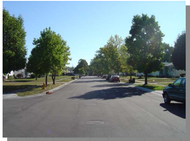
Corwin Ave. After Construction