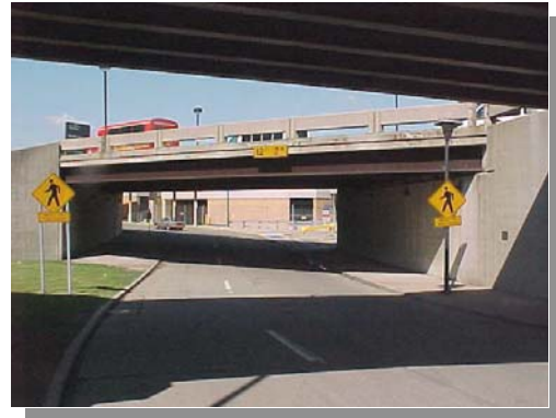
SB Terminal Dr. over Lower Access Rd.