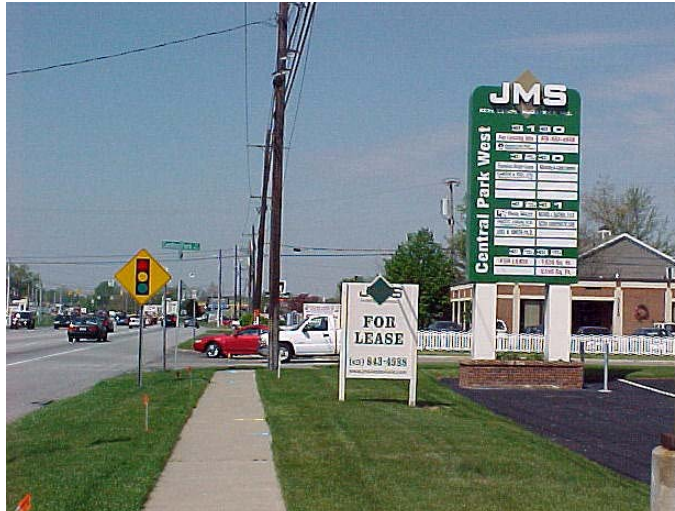
Central Park West Entrance off Central Ave