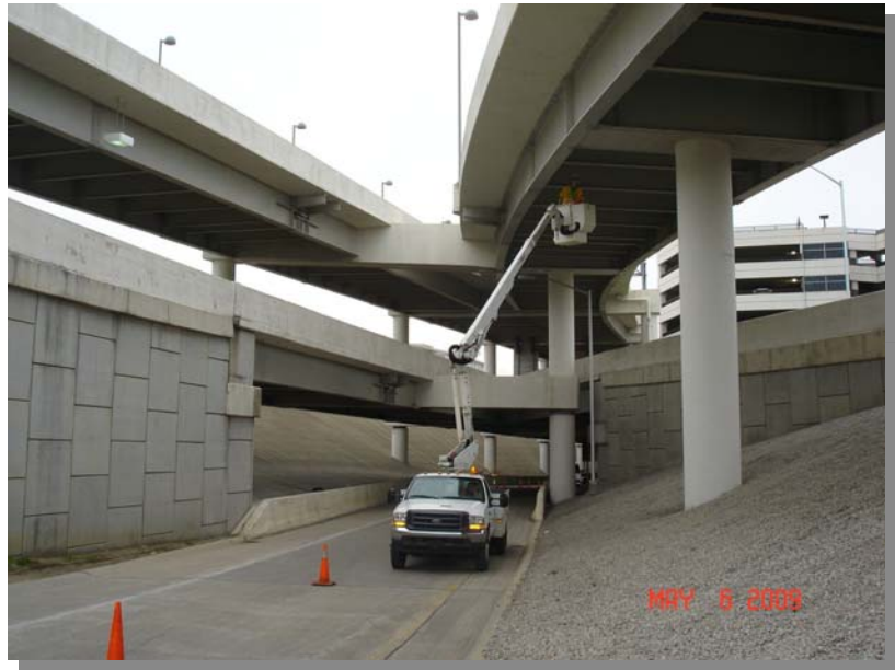
McNamara Terminal Double-Deck Structure