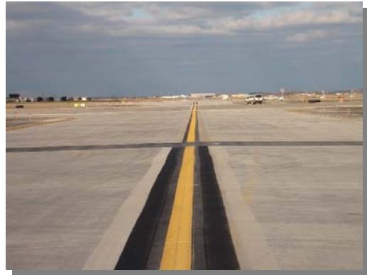
3R-27L & 9R-27L